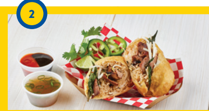
DEEP FRIED PHO LOCATED AT: EAT CRISPIES