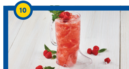
TRAIL-ADE LOCATED AT: MS. RUTH'S / RUTH'S TAMALE HOUSE