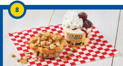
FERNIE'S FRIED CHERRY PIE IN THE SKY LOCATED AT: FERNIE'S FUNNEL CAKE FACTORY / THE DOCK