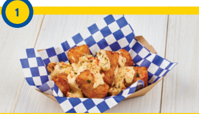
DEEP FRIED CHEESY CRAB TATER BITES LOCATED AT: MAGNOLIA BEER GARDEN / THE CAJUN COWBOY / HOLY BISCUIT