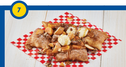
BOURBON BANANA CARAMEL SOPAPILLAS LOCATED AT: TEXAS SOPAPILLA FACTORY