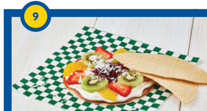
SWEET ENCANTO LOCATED AT: TONY'S TACO SHOP