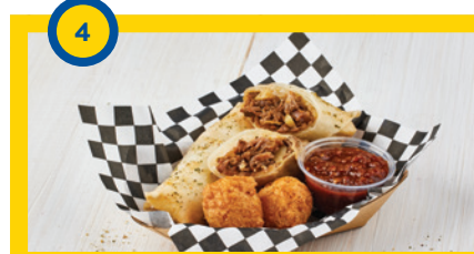
OX'CELLENT SOUL ROLL LOCATED AT: PEARLIE'S SOUTHERN KITCHEN