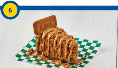
BISCOFF® DELIGHT LOCATED AT: DRIZZLE CHEESECAKE ON A STICK