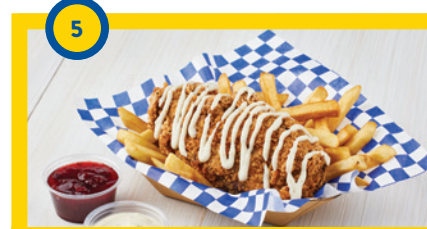
TURKEY RIBS! LOCATED AT: VANDALAY IND.