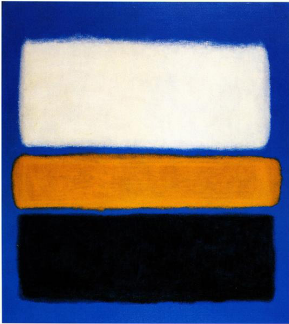
Rothko, No. 16