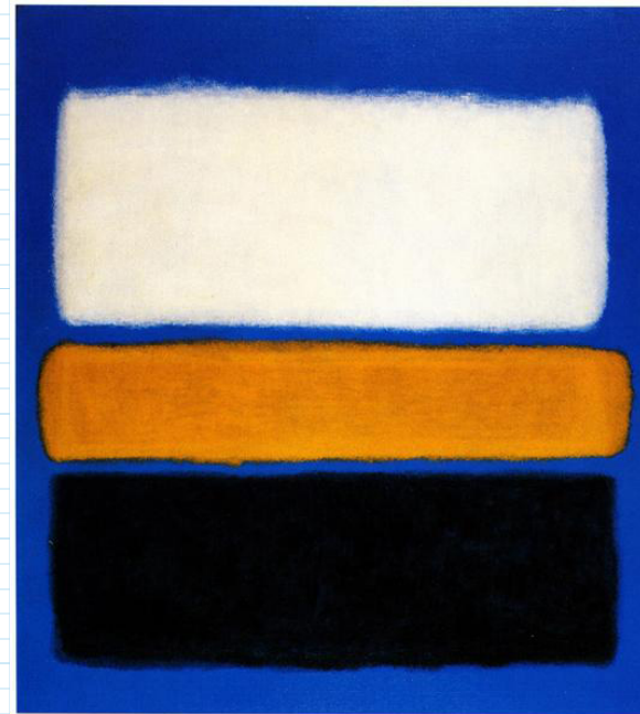
Rothko, No. 16

★ TROPIC WONDER?: Make your way over to the Swine Barn, and locate the Woofus statue, a fountain sculpture with the body of a pig, wings of a duck, tail of a turkey, Texas Longhorn horns, wool of a sheep, and neck of a horse. o What trophic level would the Woofus belong to?