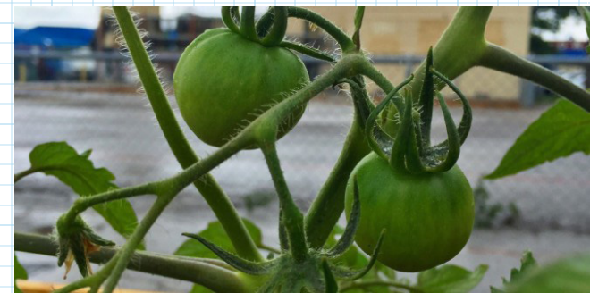
Tomatoes at Big Tex Urban Farms