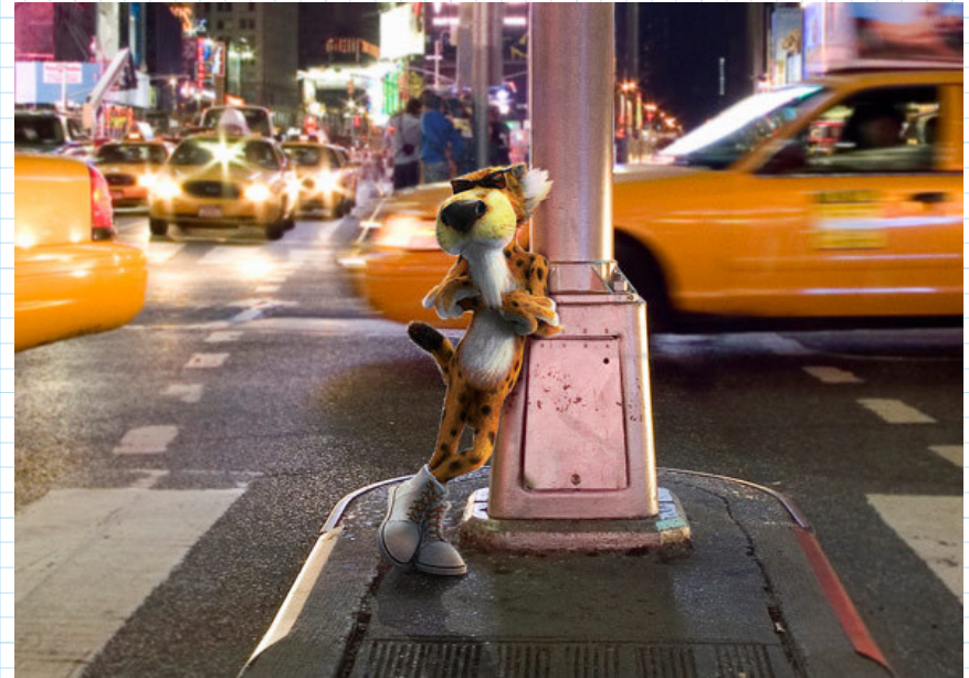
Chester Cheetah.