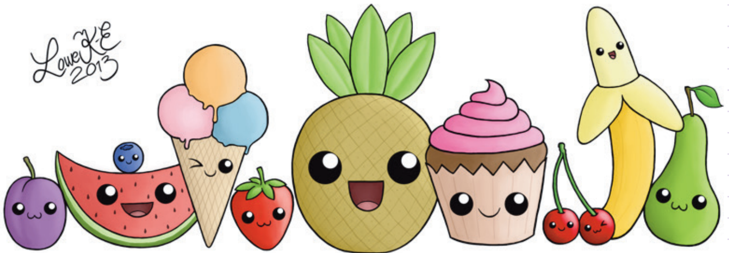
"Cute Food" by Lots of Lowe - lotsoflowe.deviantart.com